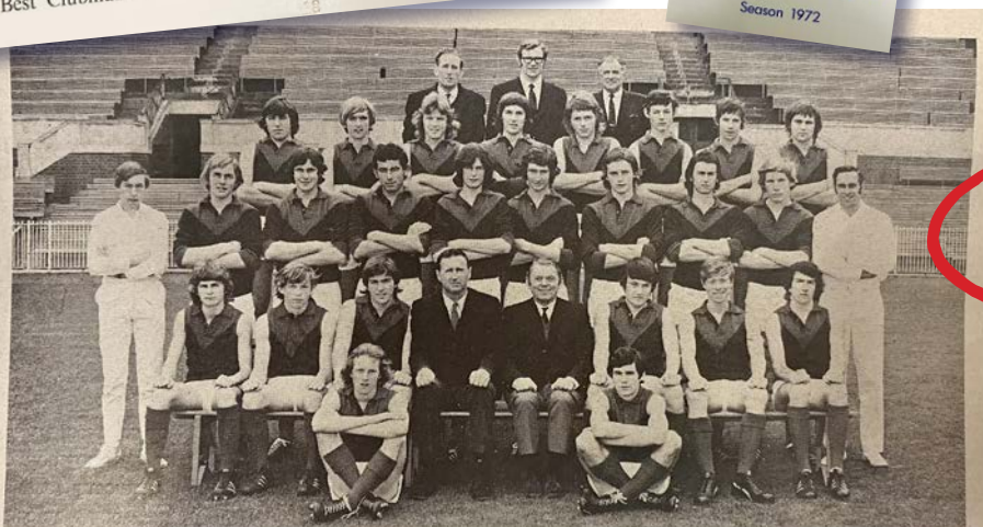
MELBOURNE FOOTBALL CLUB UNDER 17 GRADE PREMIERS 1971