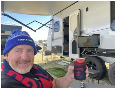
Set up to watch the Queen's Birthday game from Alice Springs