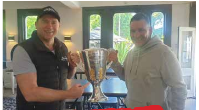
'Great to see it coming home!'