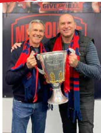
'So happy to see this.'