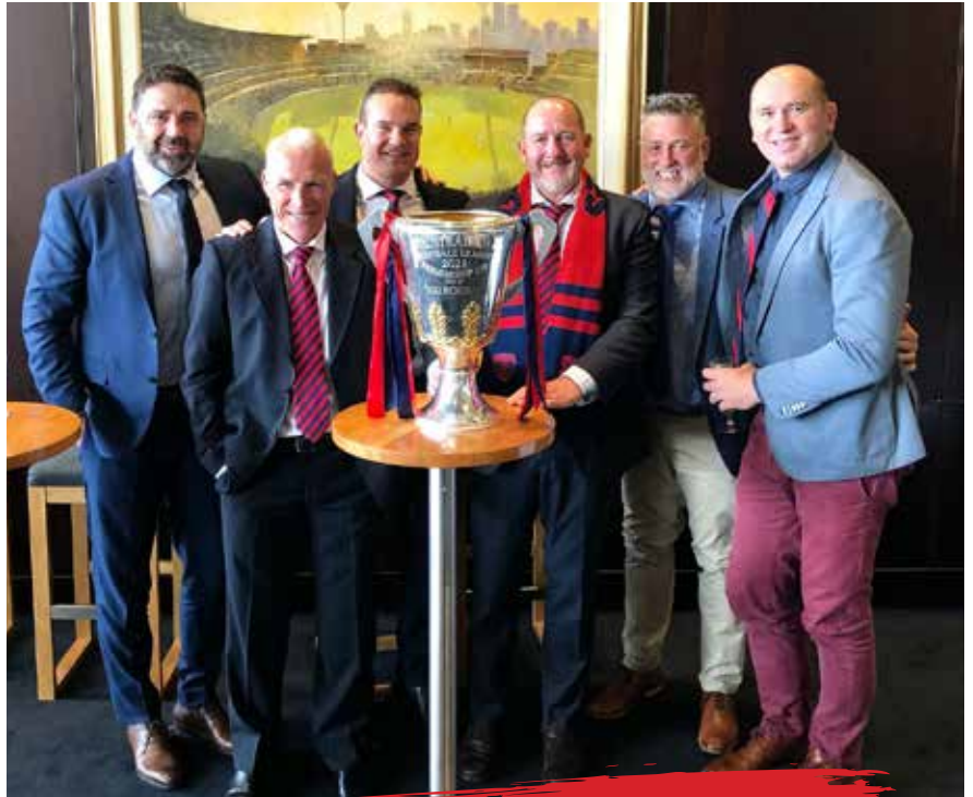
'This is really bringing everyone together.'

Of course, it has met – and is due to meet – many members of the P&PP&OA. Here are some photos of it (and its family members!), and some comments made along the way.