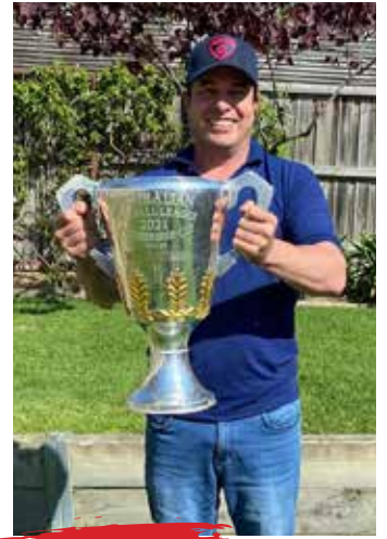
'This is just the best.'